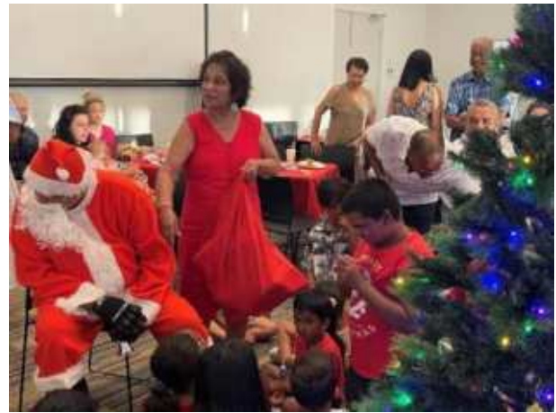
Santa, don't be distracted