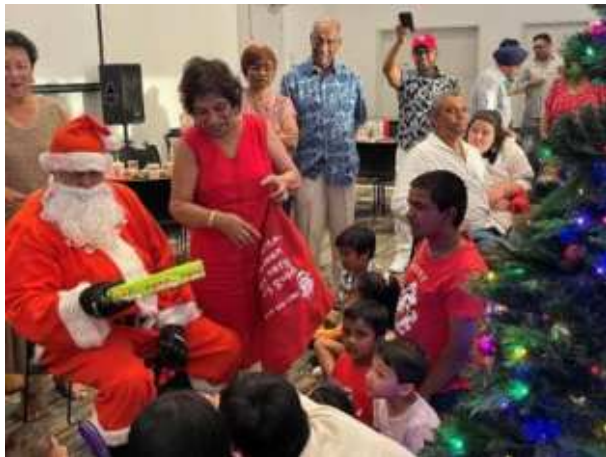
All the way from the North Pole