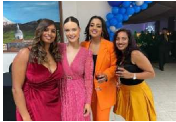
Love being here