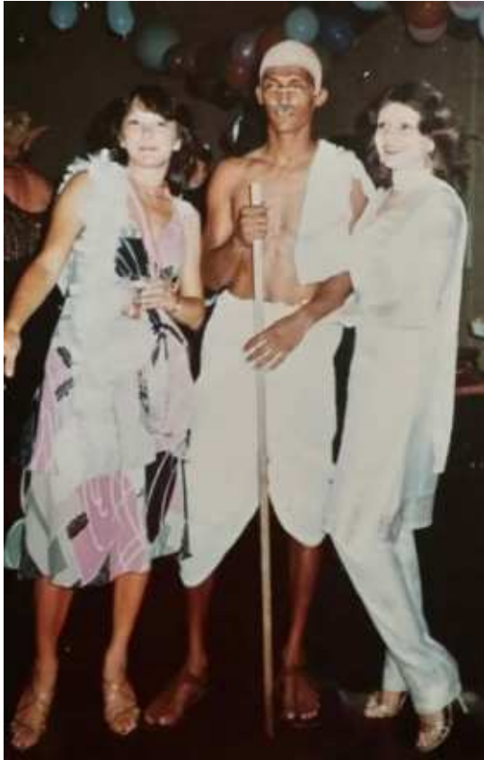
Fancy dress party