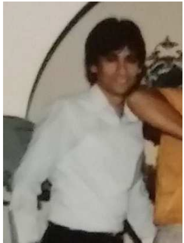
A young fella