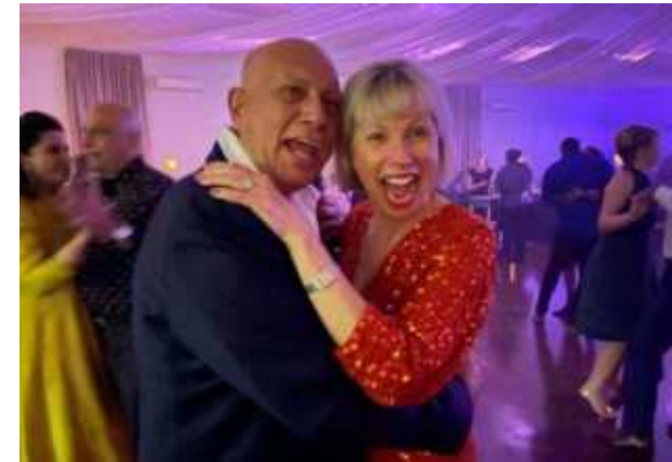
The lady in Red