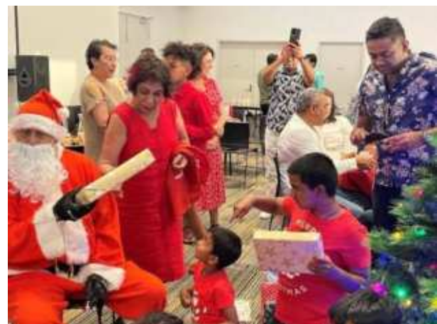
I cannot read Sugarplum Mary's handwriting