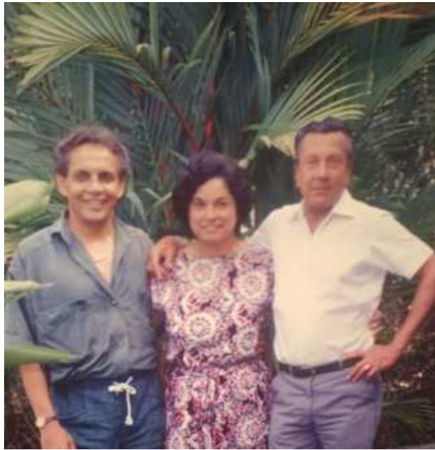
Past presidents meet in Malaysia for a godamba feed