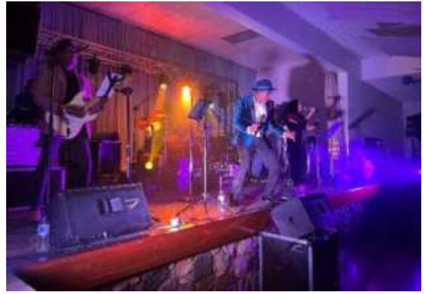
We are ready