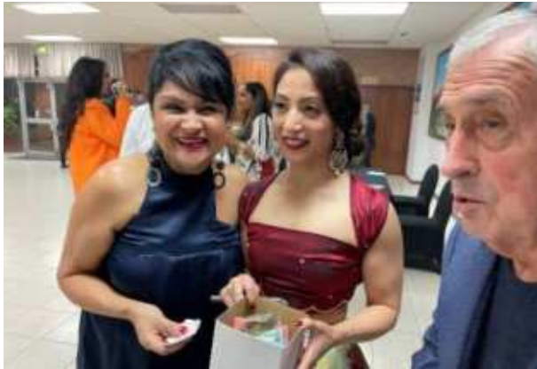
The Don with the Ladies