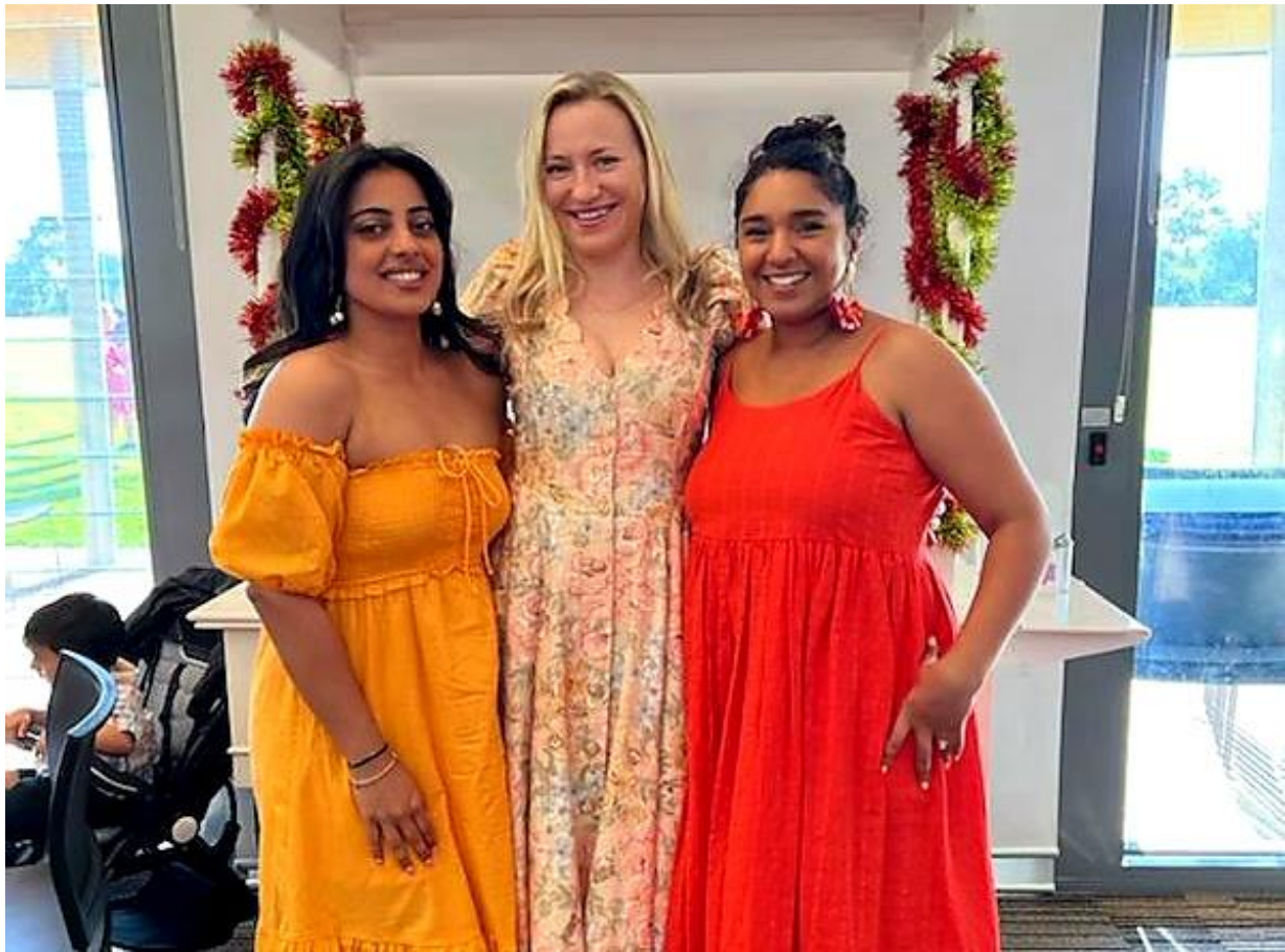
It's a wonderful time of the year