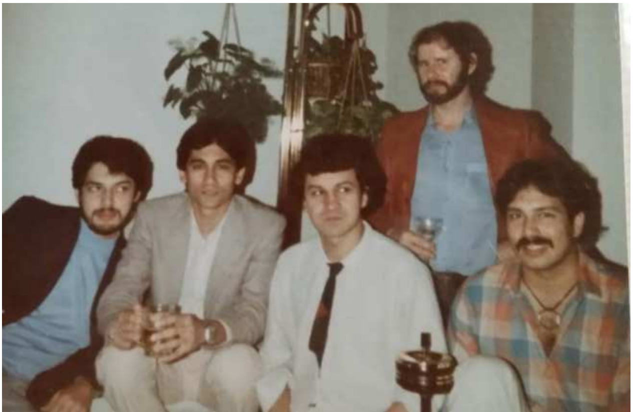
The Youth Group