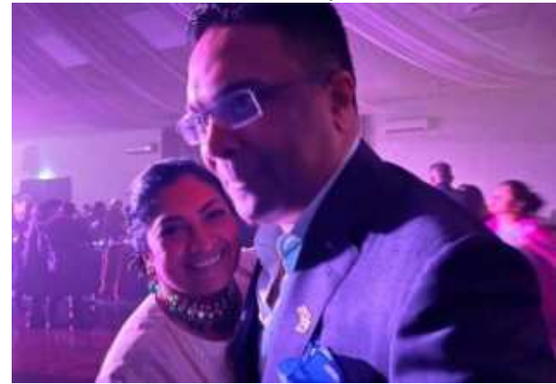
...and we did the rest