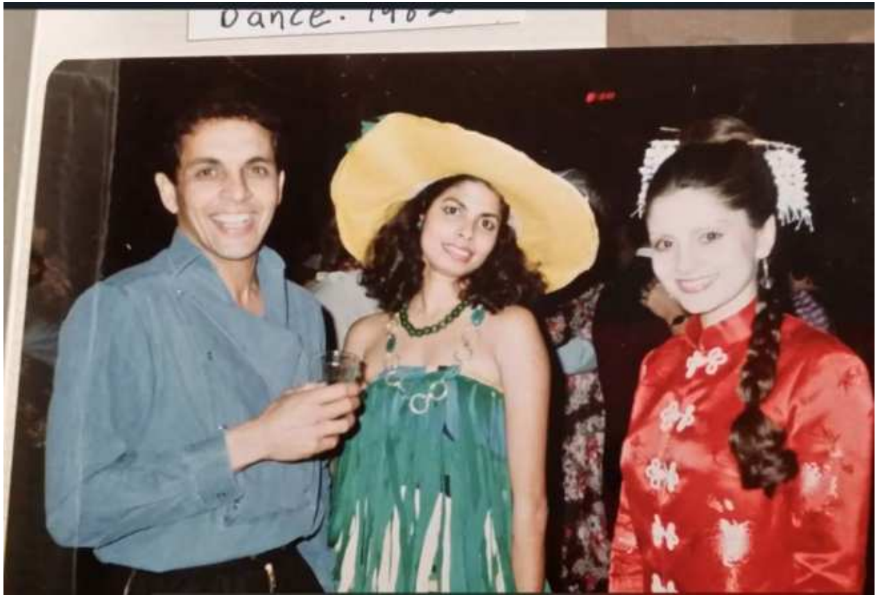
They always dressed to kill