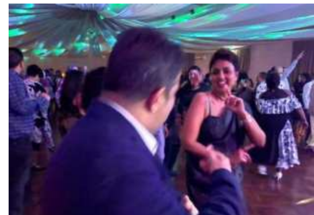
The Baila at last