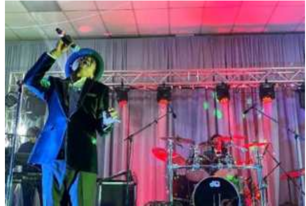
The Last Dance