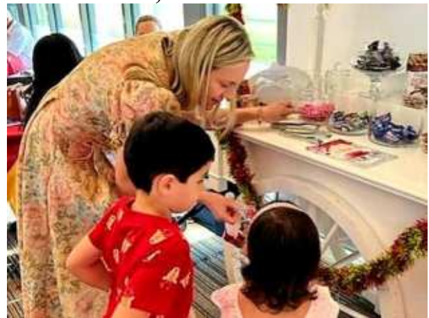
The popular Candy Cart