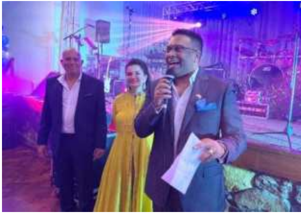
A warm welcome to one and all