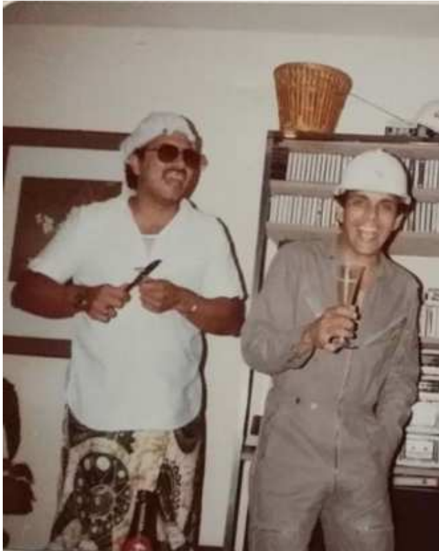
Celebrated, revelled and partied