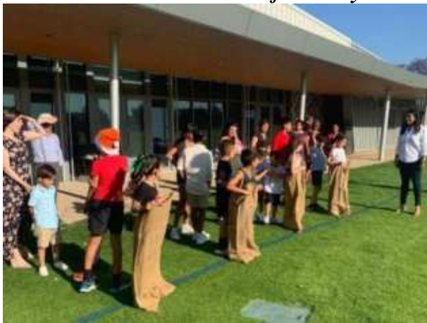
Let the Games Begin