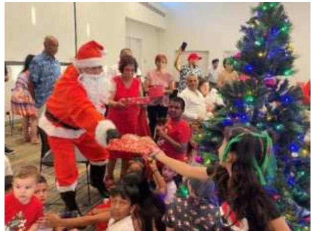
A special present just for you