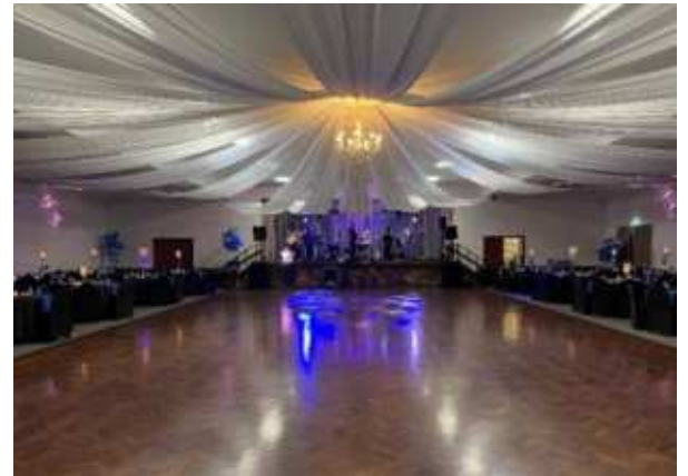
That's all folks...