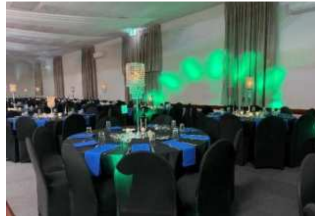
The deco was amazing