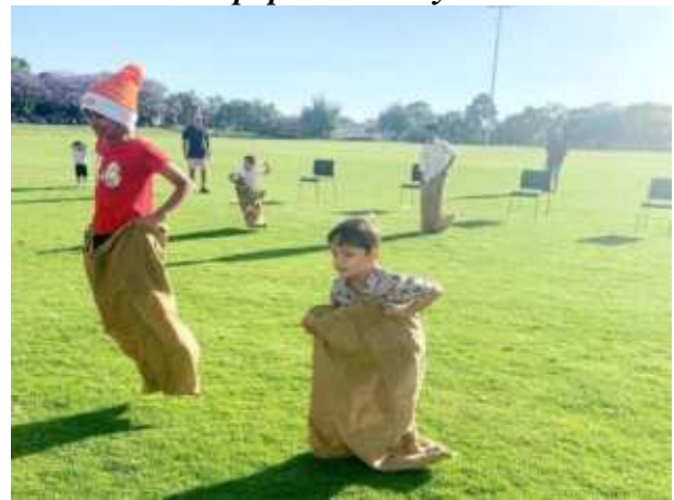
A Close Call