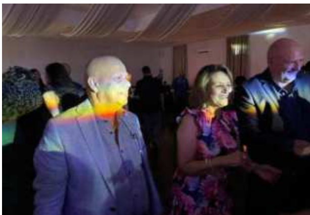
The Gingers loved the music