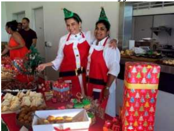
These two elves are booked for next year