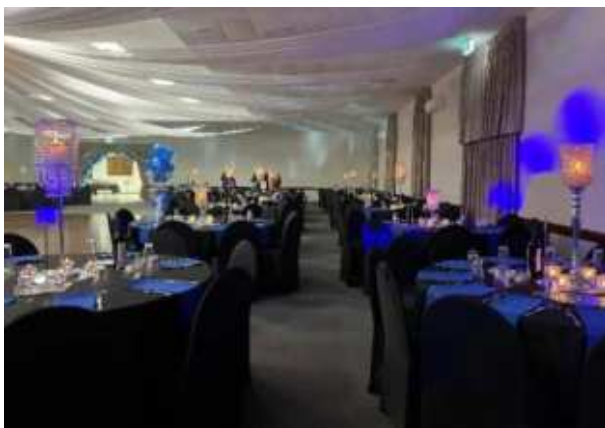
Great food service and entertainment