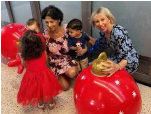
Grandchildren are a lot of fun