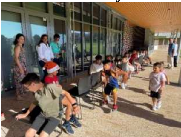
Our Children love the jostling