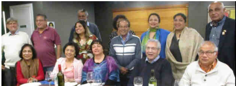
WASLA Committeee 2018-2020 at the Break-Up Party

Including the supportive partners of the WASLA Committee there was a gathering of over twenty bodies in the restaurant. Reflecting– it seems all this happened a much longer time ago – a phenomenon that may be attributed a 'psychological mind-play' due to the disastrous pandemic that has devastated the world in this Year of the Rat.